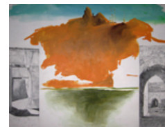
Elisa Tucci Contemporary Art