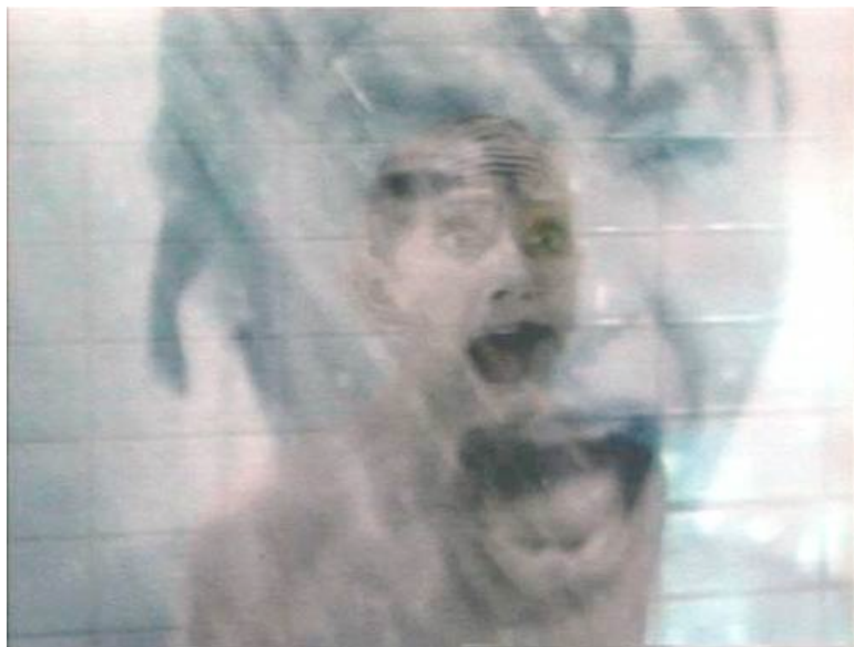
Images: Mushroom Cloud (Nagasaki) (2008); Schizo Redux (2004).